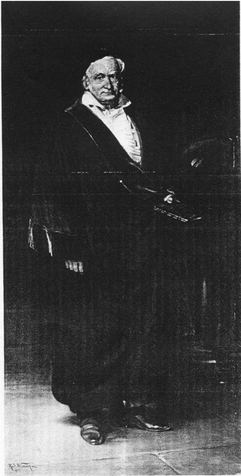
Carl Friedrich Gauss (1777–1855)