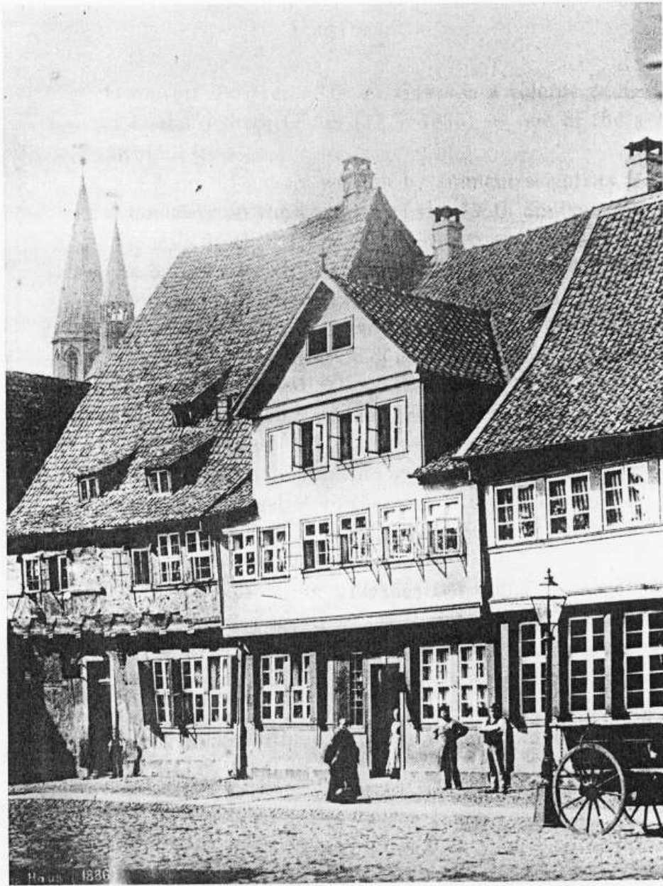
The house in Braunschweig where C. F. Gauss was born.